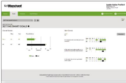
LAPII Pre Report shows data from a single assessment interval.